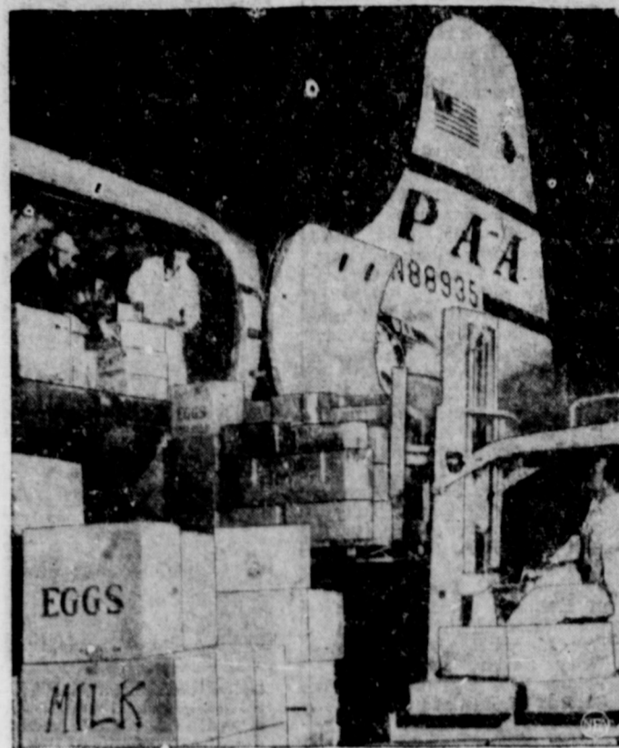
GROCERY AIRLIFT FOR ALASKA—Pending settlement of the West Coast maritime strike, groceries are being airlifted to Alaskan communities dependent on shipping for their supplies. Nome and Fairbanks are among the communities hit by the month-old strike.