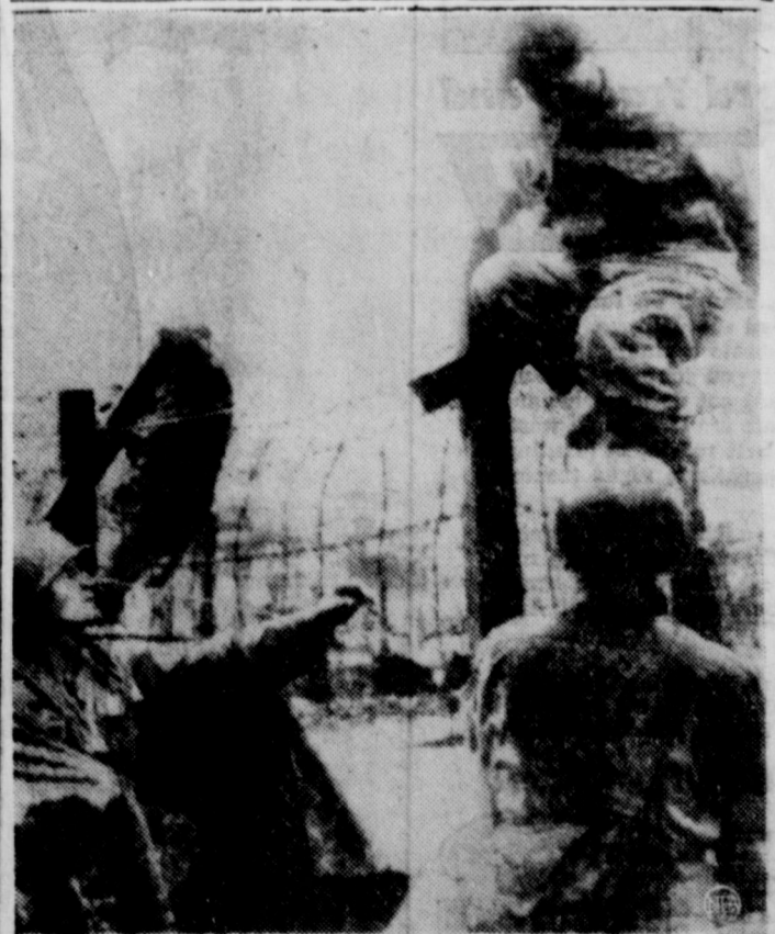
COME DOWN THERE —Two POW's who broke away from a group of communist prisoners being transferred from Compound 77 to smaller compounds on strife torn Kojé Island, sit on top of barbed wire fence as UN troops approach to recapture them. Scores of anti-communist prisoners have been killed by fanatical Reds as they attempted to give themselves up to battle-hardened troops under the command of Brig. Gen. Haydon L. Boatner. (NEA Telephoto).

Ride The "ROCKET" And Save Osborne Motor Company, Eastland