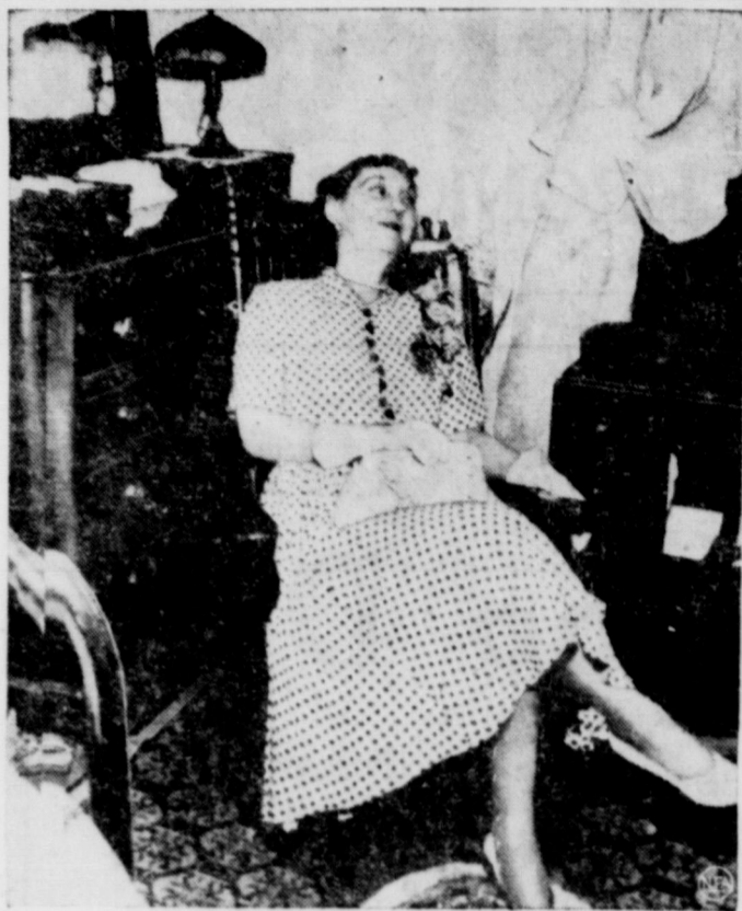
OLD ROCKIN' CHAIR'S GOT HER—Relaxing from the hectic activity of the past few weeks, Mrs. Dwight Eisenhower enjoys the old-fashioned comfort of an heirloom rocking chair in the boyhood home of General Eisenhower, in Abilene, Kan. "This is the most peaceful seat I've had since Ike and I started the rounds of farewell over at NATO," she said.

performed in eleven rodeos this season including their own intercollegiate show. Shows participated include Sul Ross, Sam Houston State, Arlington State, Baylor, Texas, A&M Oklahoma A&M, Cameron Agriculture College University of Wyoming, Colorado A&M and Texas Tech.