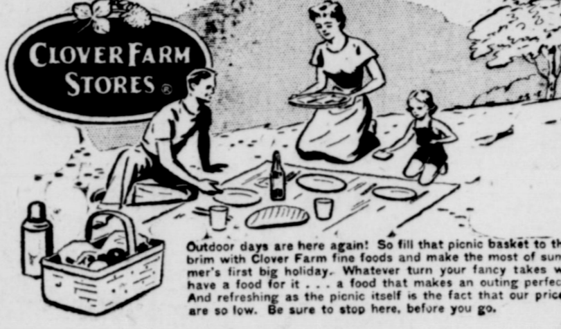
Outdoor days are here again! So fill that picnic basket to the brim with Clover Farm fine foods and make the most of summer's first big holiday. Whatever turn your fancy takes we have a food for it... a food that makes an outing perfect. And refreshing as the picnic itself is the fact that our prices are so low. Be sure to stop here, before you go.