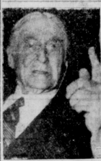
MUST TAKE LEAD — Bernard Baruch, 81-year-old elder statesman, testifying before the Senate preparedness investigating subcommittee on Armed Forces, said the United States must wake up to the fact there can be no "profits as usual, social reforms as usual, and politics as usual" until we have taken the lead in the armaments race with Russia.

The British Foreign Minister has reassured residents of West Berlin that the Big Three will not be intimidated by Russian threats in Germany.