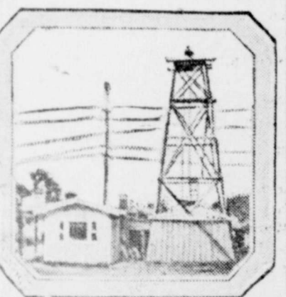
Searchlight in Operation.

In the center of the little community, a high tower with a searchlight has been erected. At night an