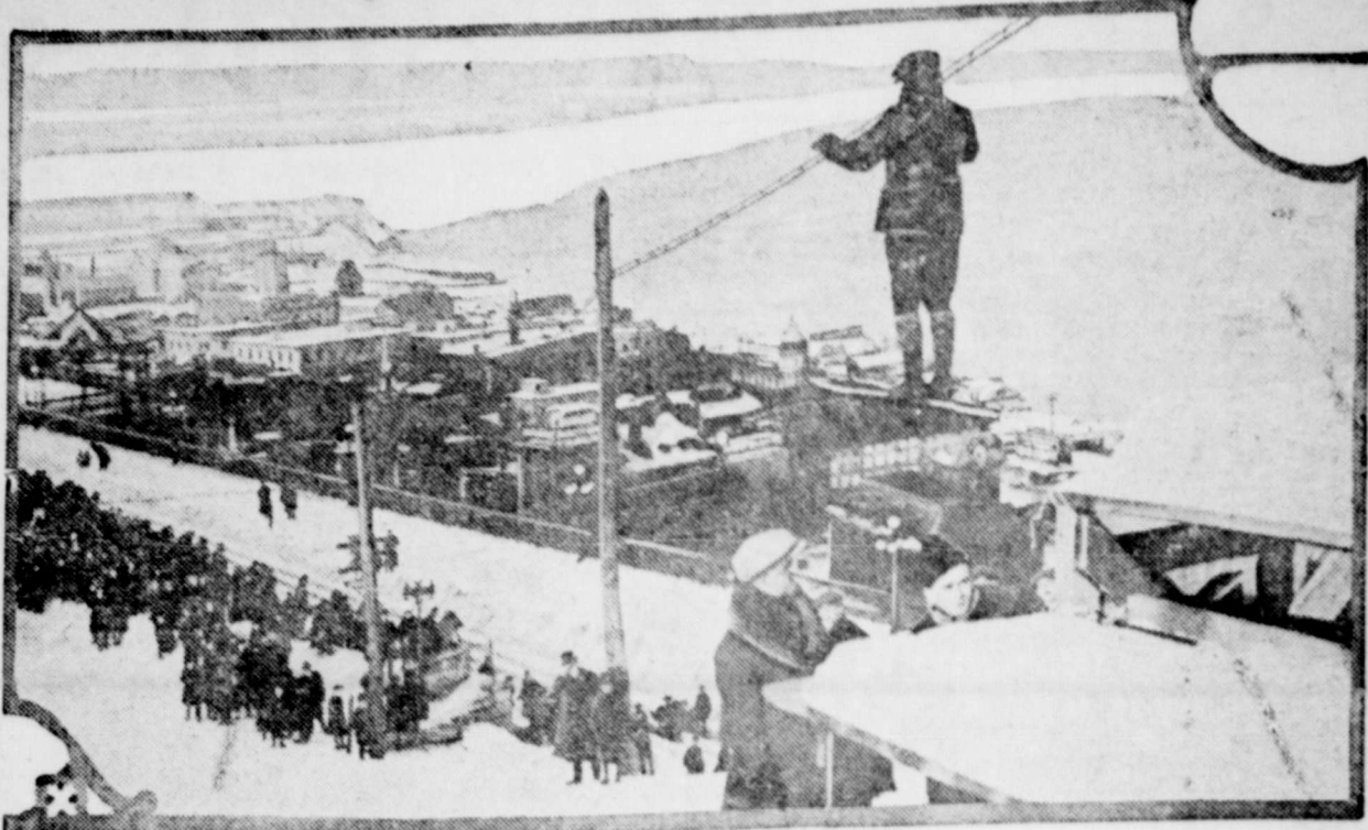
A perfect take-off from the ski-jump on the shoulder of Citadel hill in Quebec. The jump overlooks the famous three-track toboggan slide that runs the length of Dufferin Terrace.