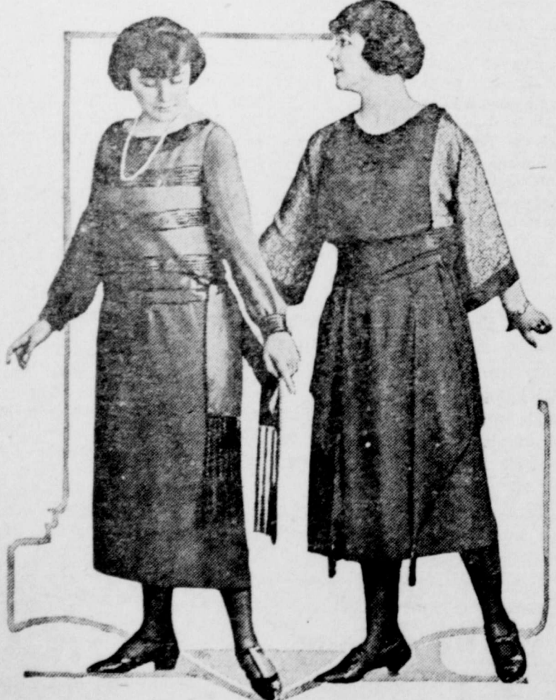
One-Piece Tailored Frocks.

A paneled dress appears at the right of the two pictured. The panels are cascaded and pointed, finished at the