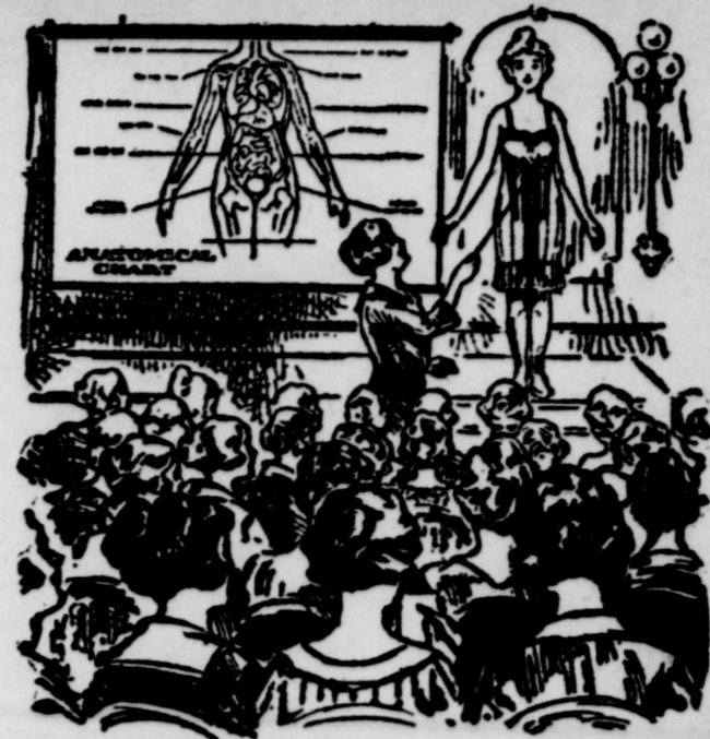
This picture gives you an idea of how corsetiers are trained for fitting service