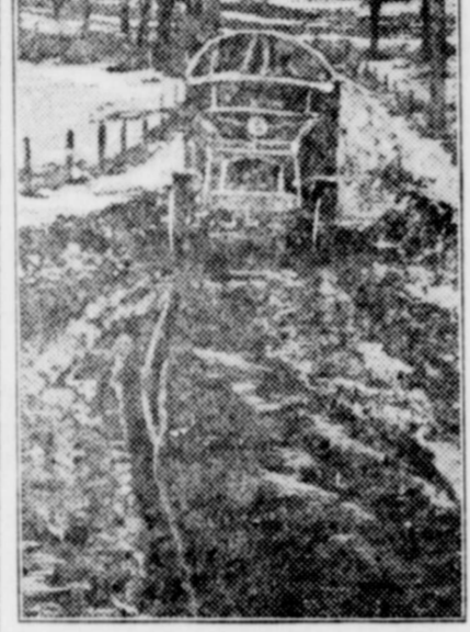
Road Cleared for Passage of Motor-trucks.

Jad Salts cannot injure anyone; makes a delightful effervescent lithia-water drink which millions of men and women take now and then to keep the kidneys and urinary organs clean, thus avoiding serious kidney disease.—Adv.