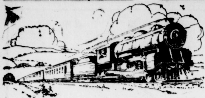
Out of accumulated capital have arisen all the successes of industry and applied science, all the comforts and ameliorations of the common lot. Upon it the world must depend for the process of reconstruction in which all have to share. —JAMES J. HILL