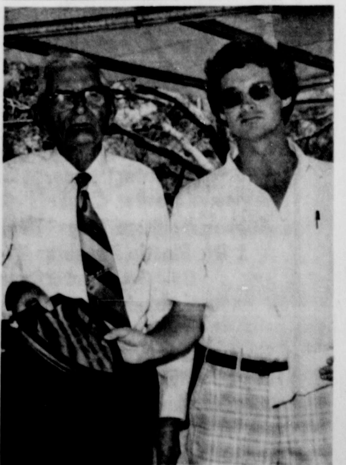
60 Years Service to Schools

Mills County and area counties showed gross sales for 4th quarter of 1978: Mills Co. - $7,462,108; Brown - $93,740,737; Comanche - $32,873,801; Hamilton - $17,999,046; Lampasas - $12,778,388; Mason - $5,709,736; San Saba - $8,384,414