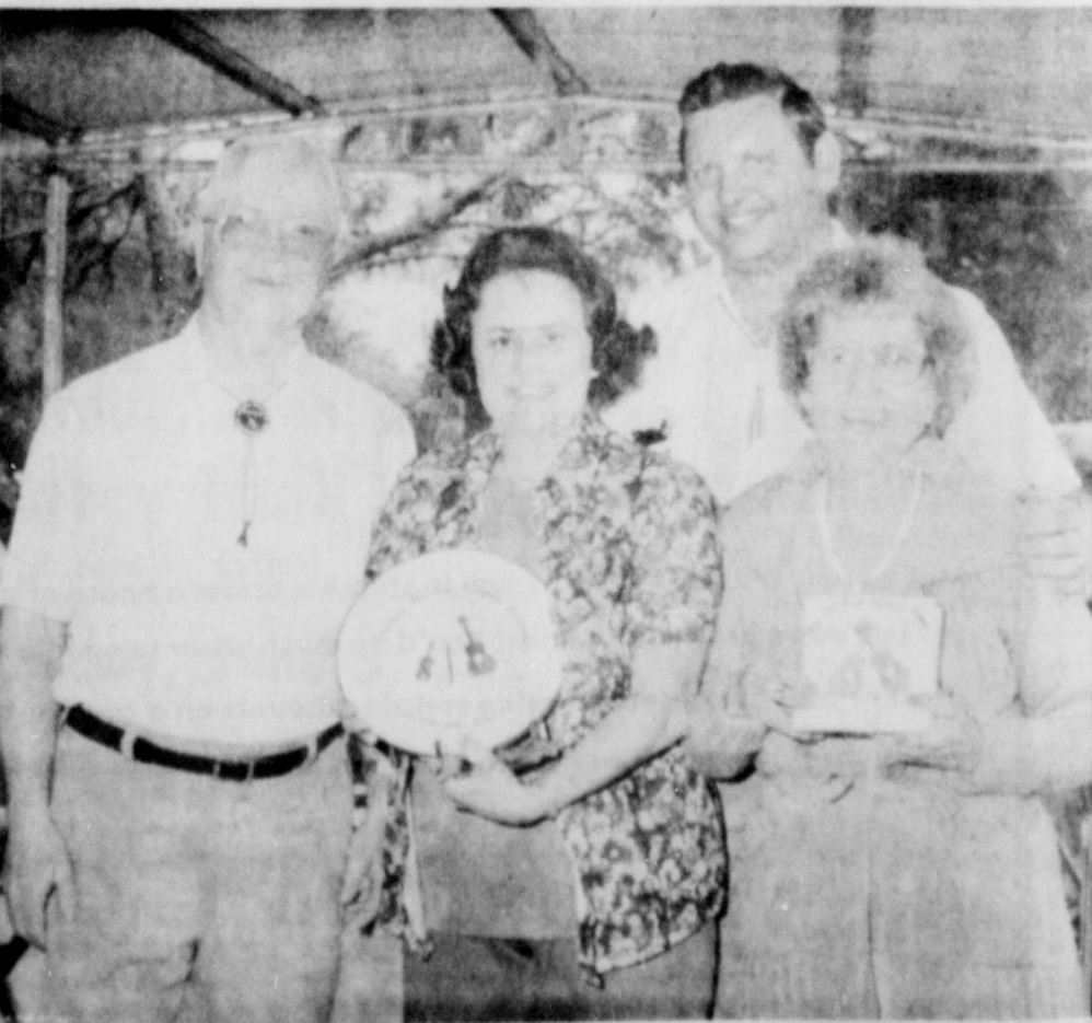
Bookkeepers and Emcees are Necessary

They were snapped while listening to the fiddling contest Saturday at the Mills County Park.