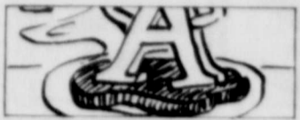
A two-ounce serving of cooked beef liver provides more than 30,000 units of Vitamin A, six times more than you need in any one day.