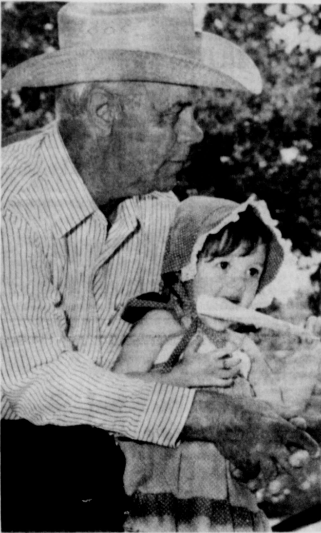
Ummm! Good To The Last Bite

One of the sidelights of the Festival, although not officially a part of it, was the opening of the City Swimming Pool. It was filled with youngsters enjoying their first swim of the season.