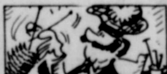
The art of knitting is said to have originated in Scotland.

Everyone is invited to come out for an afternoon of competitive and interesting action.