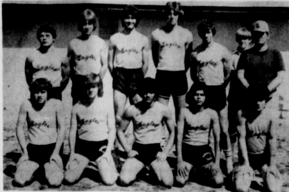
Eagle Varsity Track Team