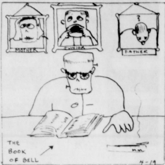
THE TELEPHONE BOOK...

I thought I made a funny when I remarked, "Hey, we got the new phone book. I haven't finished reading last year's!" It was made-up therefore fiction. I was to learn that truth is stranger than fiction.