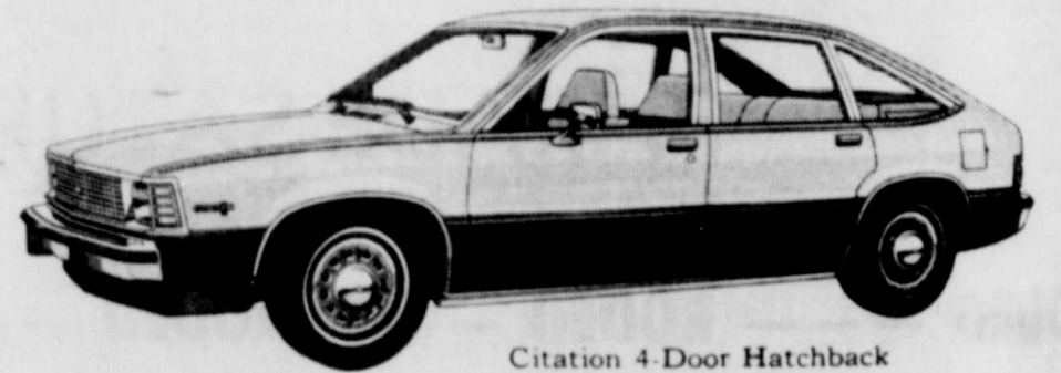
Citation 4-Door Hatchback