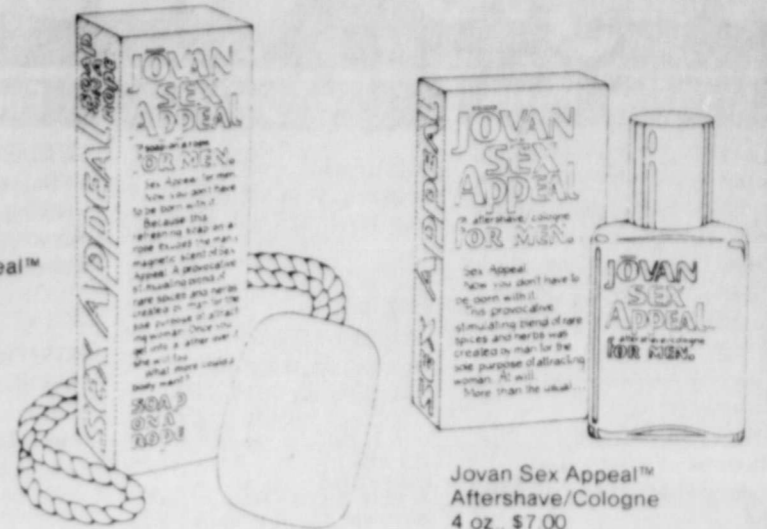
Jovan Sex Appeal™ Soap-on-a-rope 7 oz. $4.00