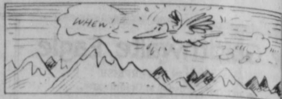
Migratory birds in Asia cross the Himalayas, the world's highest mountains.

"I understand they have a curfew law in this village," said the visitor to the proprietor of the general store. "No," he answered, "they did have one, but they abandoned it." "What was the matter?" "Well, the bell rang at 9 o'clock and almost every body complained it woke them up."