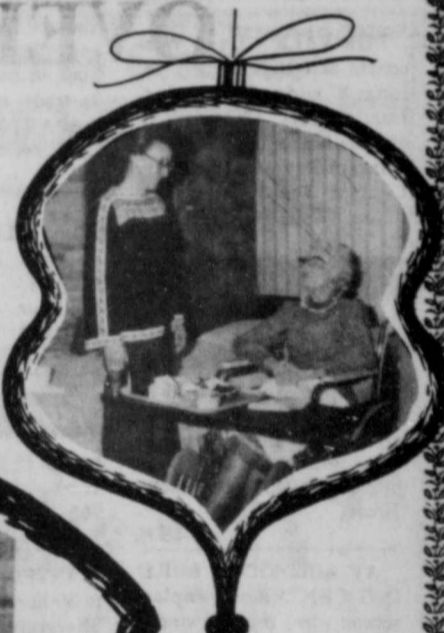
Join Our Activity Director in wishing Everyone a Merry Christmas and Happy New Year!

All 85 of us join in Wishing You the Best Holidays Possible.