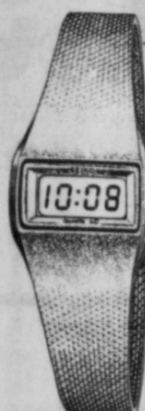
No. YH006M -- $275.00. Ladies' LC Digital Quartz. Yellow top/stainless steel back, gilt dial/frame. Also available in white -- $275.00.

French physicians used it as an antidote for poisons, and one 17th century British physician observed that the plant is "good for the grief of itch, sores, toothache, and the biting of mad dogs and venomous beasts."