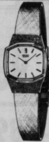
No. YJ048M -- $225.00. Yellow top/stainless steel back, gilt dial. Also available in white -- $225.00.