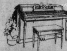
2116-Mediterranean Oak Piano

Give the Too-Big-To-Wrap and Too-Great-To-Wait Family Gift from S&M Music