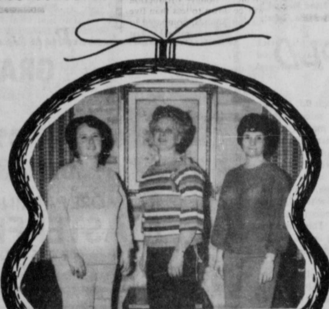
Merry Christmas and Happy New Year from our Office Personnel and Medical Records!