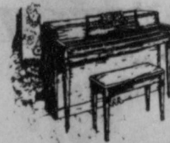
2116-Italian Provincial Heritage Fruitwood Piano

New Shipment of PIANOS & ORGANS Just In Time For Christmas