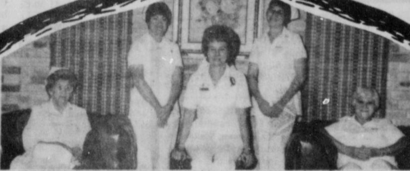
Our Nursing Staff Wishes You A Very Merry Christmas and Happy New Year!