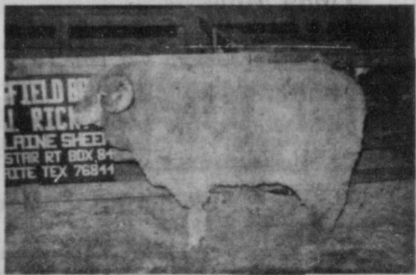
Grand Champion Ewe