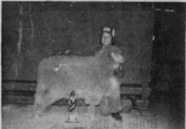
Grand Champion Ram