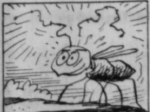
The antenna of a male wasp has 13 joints.

sulted in 8 deaths and 249 injuries. This compares to 445 accidents, 6 deaths and 186 injuries reported during this same period last year.