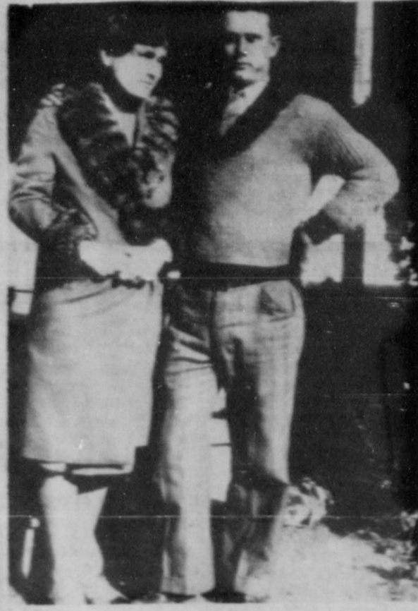
January 14, 1928