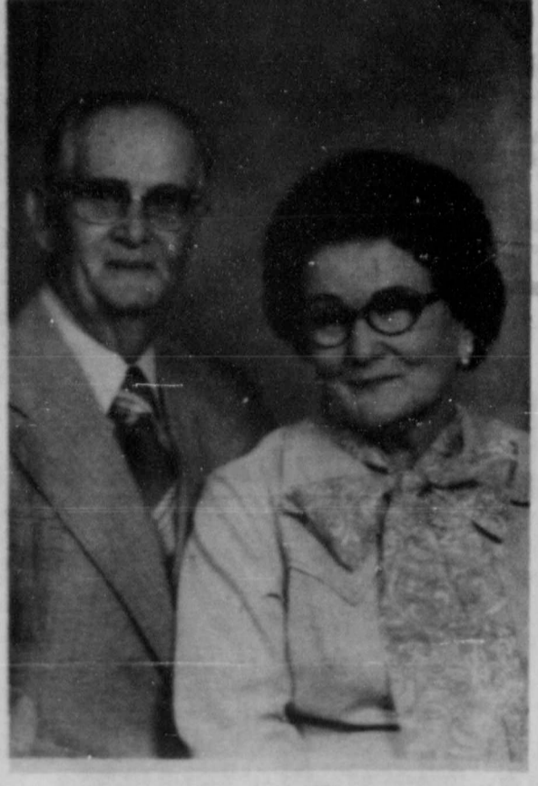
January 14, 1978