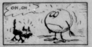
Some say pearls are unlucky.