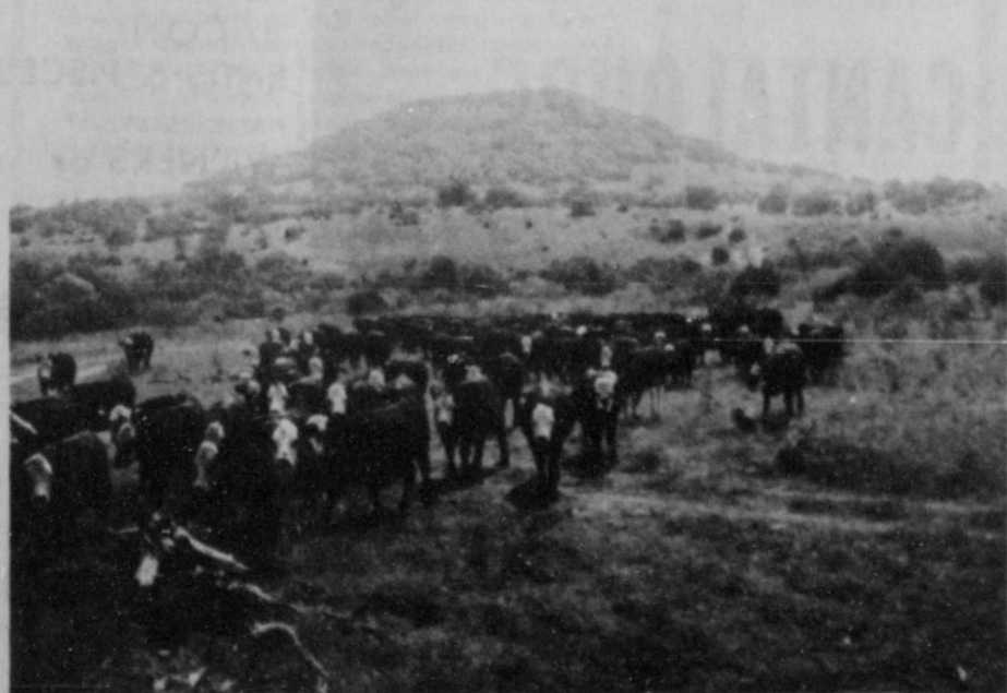
SAN SABA PEAK — This "Mountain" is one of the outstanding historical landmarks in this part of Central Texas, and has received designation in many books, and articles of early Texas History.