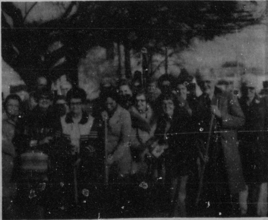
Members of the Goldthwaite Garden Club are pictured above on the Mills County Courthouse plaza

where they planted a yaupon tree in observance of Arbor Day.