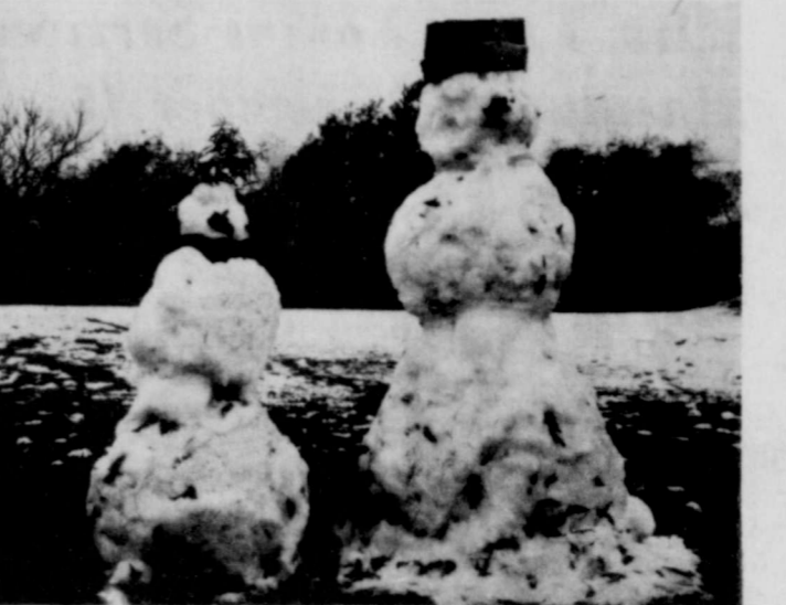
Snow People The snow which fell on Mills County late Friday evening made it possible for a number of snow people to be created for the enjoyment of the local residents. Mr. and Mrs. "Snow" were created on the south side of Childress Clinic and Hospital lawn following the unexpected snowfall here last weekend.

in over the weekend were in excellent condition and the antlers ranged from average to above average. The turkey kill was also very light over the opening weekend, but there was a good turkey hatch and they are in very good condition, also. As with the deer, the turkeys apparently got under the bushes and stayed. "Hunters can expect very good hunting in the local area when the weather permits."