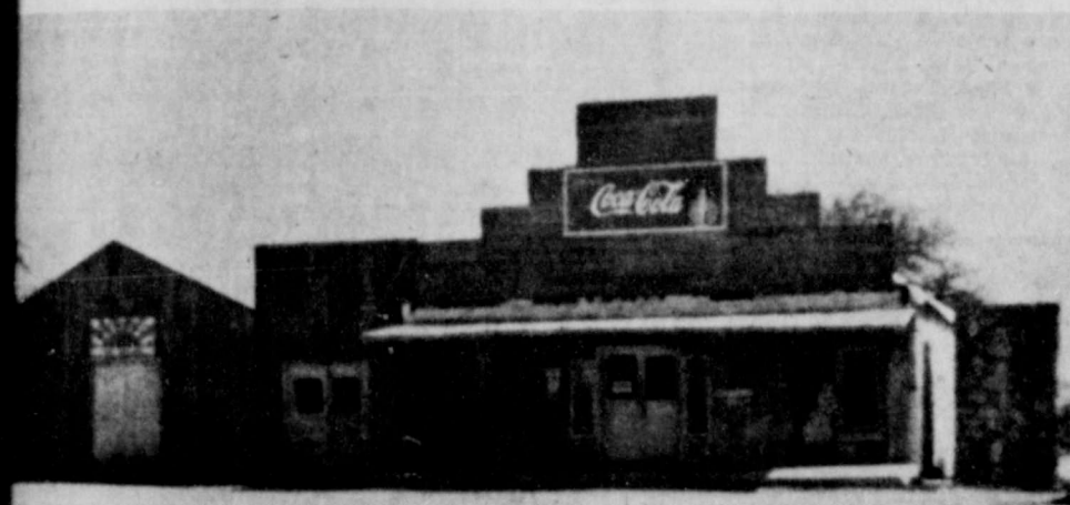
THE DICK JESKE STORE IN STAR, TEXAS

Watch all the Stars over Channel Ten, KWTX-TV, Waco