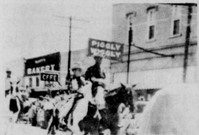
EARLY DAY PARADE - In the center of the picture are,