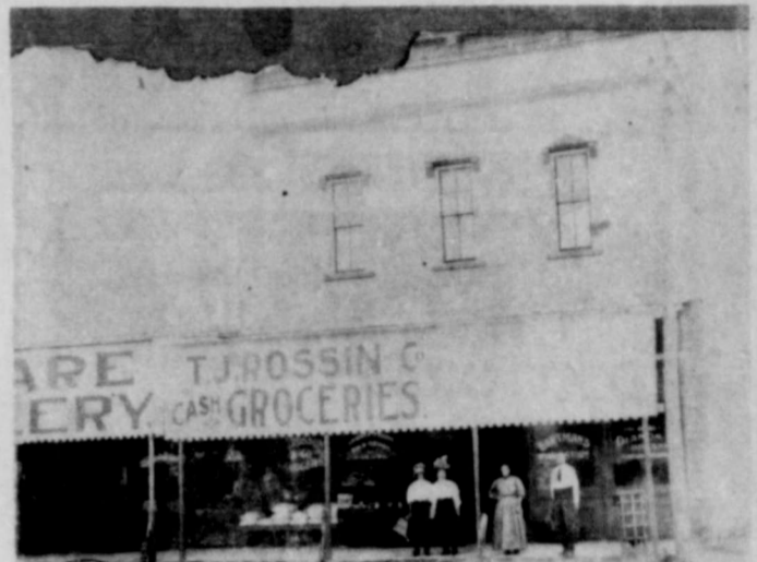
OLD PALMER BUILDING - On the left are two ladies whose names are unknown and stand-

Editor's Note: A long search for pictures of the original Palmer Building resulted in the following two snapshots. The building is located in the far right of the Parade picture.)