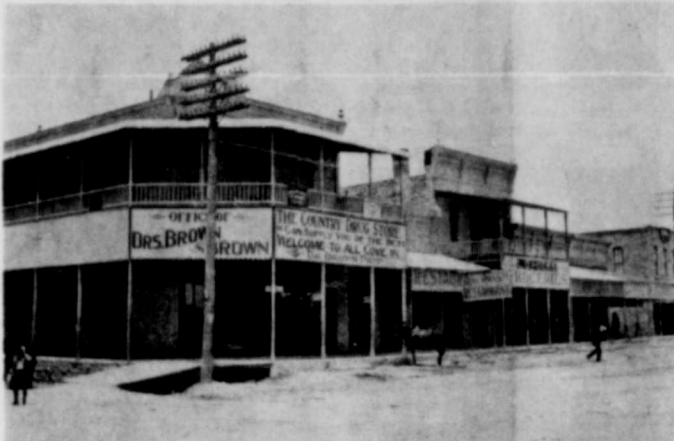
Early Goldthwaite Drug Store

Volume 80 - Number 1 Goldthwaite, Mills County, Texas 76844 Thursday, April 8, 1976