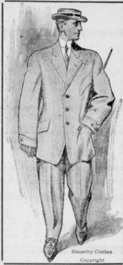
Sincerity Clothes Copyright

Our "SINCERITY" clothes for this season are (if possible) even Better and Prettier than ever before.