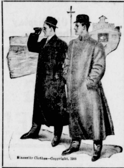
Sincerity Clothes—Copyright, 1926

We Sell Them Cheaper Than Anybody. Odd Coats from $1.00 to $3.00. Odd Pants from 25c to $3.50. Let Us Show You.