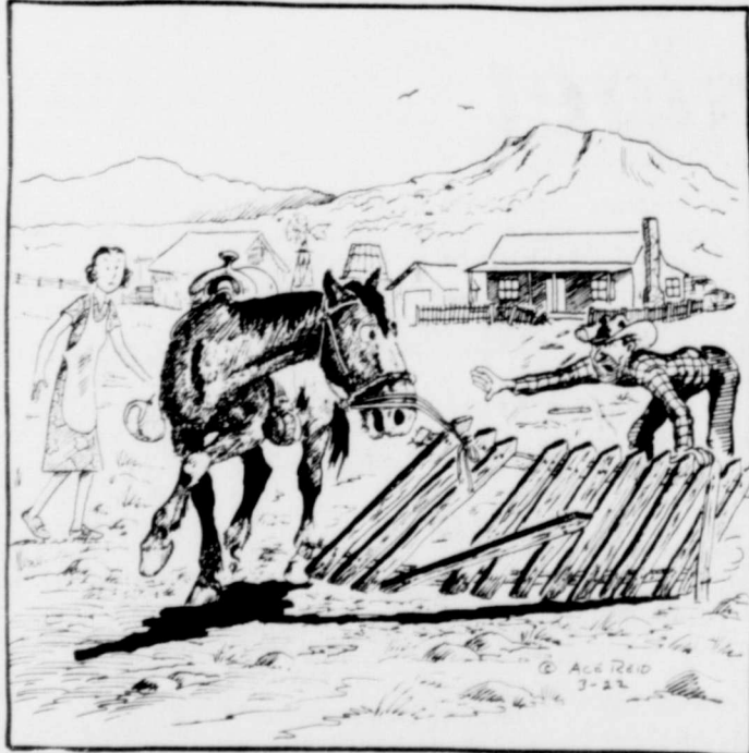
"Aw quit nagin' at me Maw! I wuz gonna build a new fence anyhow!"