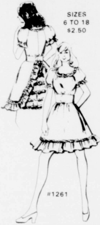
Ladies' Squaredance Dress

For the feminine look, select the dress with ruffles and lace. The elasticized neckline is formed by the h-dice and raglan-styled, short, puffed sleeves. The bodice and 8-gore skirt are gathered on to a fitted midriff section. Ruffles accent the skirt. Trim is optional.