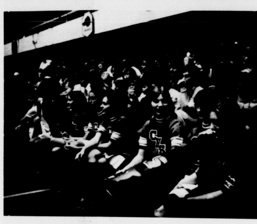
LOTS OF CROWELL FANS — at the state basketball tournament in Austin last Saturday, show a portion of the large crowd of Wildcat fans on hand for Crowell's games. In addition to numerous cars, a charter bus load of fans also made the trek to Austin.