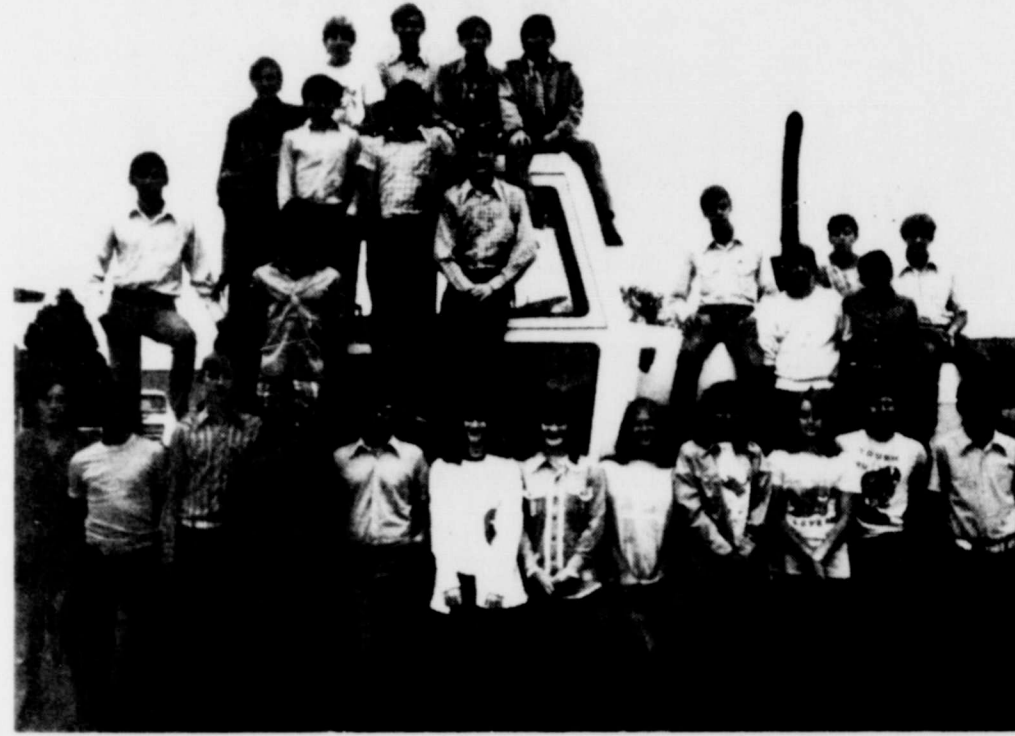
TAKE TRACTOR SAFETY COURSE —This group of young people literally covering up a tractor furnished by McLain