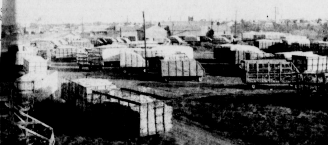
LOTS OF COTTON --This view looking north at the Farmers Co-Op. Gin in Crowell shows so literally hundreds of bales of cotton waiting to be ginned. The county's three gins have been swamped like this for several weeks and there is still lots of cotton to be gathered. This photo was made last Friday morning.