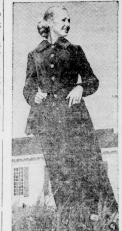
REGAL —Plus cotton corduroy in the widest of wales sweeps into a long coat for the upcoming holiday season. In cranberry red, it's embellished with a long stretch of silvery buttons. By Lanz.

We Resent . . . "We don't so much mind the Communists rewriting their own history, but we do resent the efforts of the Communists to write and rewrite our history."—Altoona, Pa., Mirror.