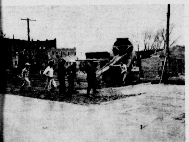
POUR FLOOR FOR NEW BUILDING —After a delay of several weeks on account of bad weather, Setliff Machine Shop crew finally were able to start pouring the floor on the new building to house John T. Athletic's Crowell plant. This picture was made Dec. 28. Weather continues to halt work on the building.

room house rowell. Ca 25-4 eka camp $250.—B 26-32 el gates an for 1963 Milburn Ca 17-25 stered to uality.—M 1592. Deere R 6 Internation ood shape— 17-41 that is, clea Rent elect R. Womac Market an f our heal sell. Price 24-2 finest deli fish. Sing Two house y Mill. Phon 23-4 els from TX-750, No Vernon, Te s and serv 26-3 Works, Ch e 937-39 and Vern ry Road, p Georgia an rbing, was e. Friday, S Rocker, G r, bathro women's a Miscellane Black, Ea 26-11 al good us e 3-pt. hit n wheatfla ely re-cond "Gold Sea se, but som line. — McLa s Truckin ale.—W. F 1. nd overha iles west Phone 684 17-11 il wiring, a iting serv n. — Gera 30-4 — West Te ) W. Wilbu 40-4 CORP. off inity to m area. Frin ar cash an s of exper Pate, Pre b. Box 71 6101. field of alt secure a criptions a s. For fur d The Nor cil on Al olism. Ron ing, Wich 1-3461. Aft Pray—P 25-3 d en yearli d 7 on rig see Bill Be 26-3 d to strip ce ett or pho 21-4 g cook. H a week. — 26-4 sitting to Glover. e to do iron 684-4271, at 322 Ea 26-14 it nd two bel ill 684-66 33-4 st in writ 9c each