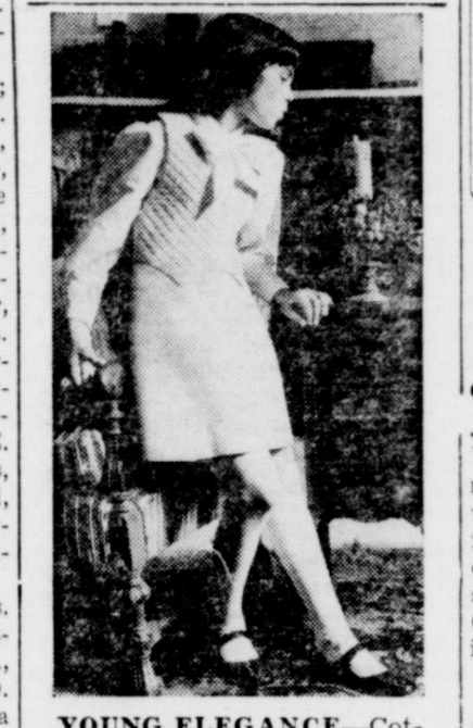
YOUNG ELEGANCE —Cotton velveteen in soft pink creates a grown-up look for holiday wear. The skirt is attached to a silk-like blouse and topped by a quilted velveteen vest for a three-piece effect. It's from Cinderella's CC Boutique collection.

"In some dim beginning, man created the institution of government as a convenience for himself. And ever since that time, government has been doing its best to become an inconvenience. Government bureaus and agencies take on a life and a purpose of their own. But I wonder if it happens because so many of us—all of us probably—read and hear, and just repeat what we think is a truism—that when a public problem develops, government is forced to step in. That is utter