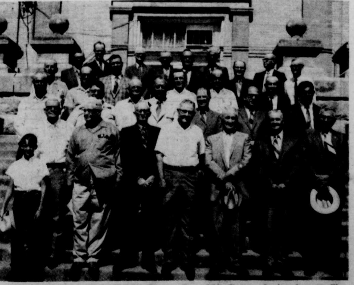
AT BIBLE CLASS' 20TH BIRTHDAY —Pictured above are some of the 65 men who attended the 20th birthday of the Men's Down Town Bible Class on Sunday, June 27. The meeting was held at the community center.