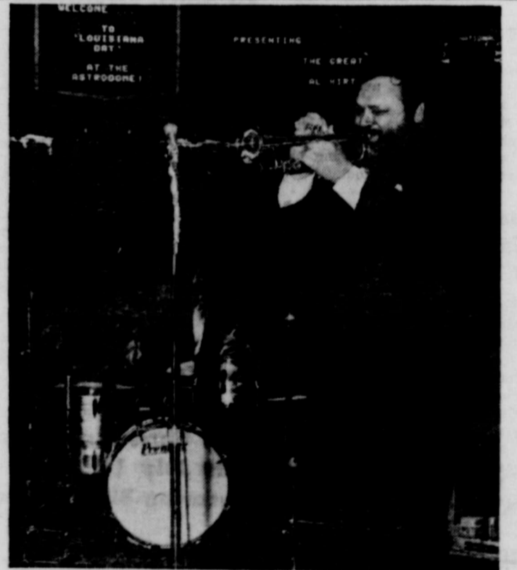
AL HIRT IN THE ASTRODOME —Big Al Hirt, Louisiana's and the world's favorite trumpeter, will give a one hour show in the Astrodome immediately after the Houston Astros play the New York Mets Saturday night, July 17. The baseball game begins at 5 p.m. Hirt, shown here performing in the Astrodome in 1969, will be part of the big Louisiana Weekend in the Astrodome festivities. The Astros will play the Mets at 7:30 p.m. Friday, July 16, the 5 p.m. Saturday game, and then play the Philadelphia Phillies in 2 games on Sunday, July 18, beginning at 1:30 p.m.