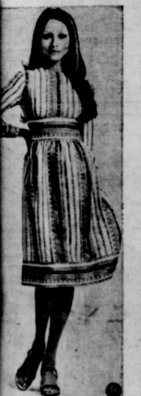
PE APPEAL - Navy white cotton stripes up new directions for summer dress. Used on horizontal, they focus on at the waistline em. On the vertical, emphasize the full shirt and softly gathered of the Carlye design.