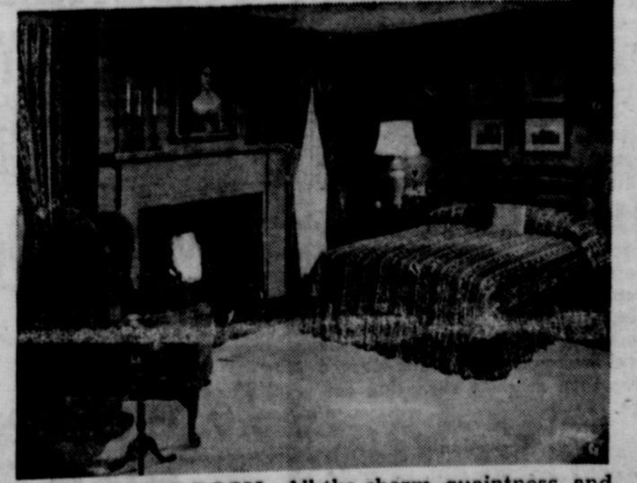
IN THE GUEST ROOM—All the charm, quaintness, and hospitality of an English inn are reflected in this guest room with traditional furniture and deep turquoise walls. Adding to the atmosphere of warmth and graciousness is an English-inspired cotton fabric printed in blue and rust floral stripes. By Waverly, it's the perfect choice for the quilted coverlet, dust ruffle, and tied-back draperies.