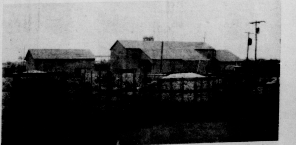
LOTS OF COTTON—Although only a few trailers are visible in the above picture, there were a large number of trailers loaded with cotton waiting to be ginned when this photo was made last Thursday afternoon at the Farmers Co-Op. Gin in Crowell. (News photo)