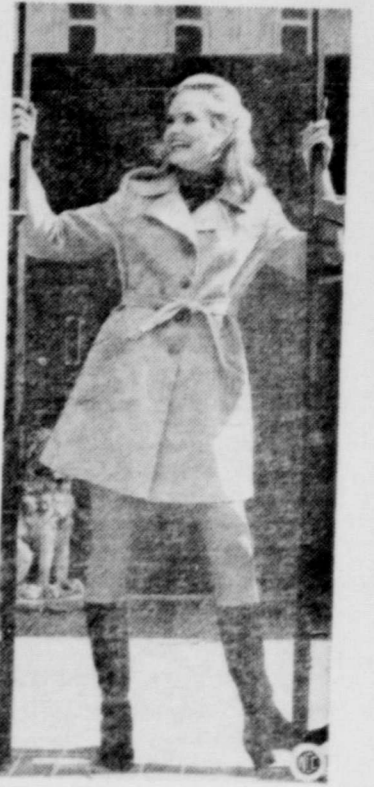
THE SHORTER VIEW—Cotton sueded with shadings that make it look like authentic animal hide is the choice for a casual mini-length coat in 1970's soft, unconstructed look. In chamois, antelope, or brown, it comes with a matching hat and bag. Styled by Winett of California.

Great Wall of China is 1,684 miles in length.