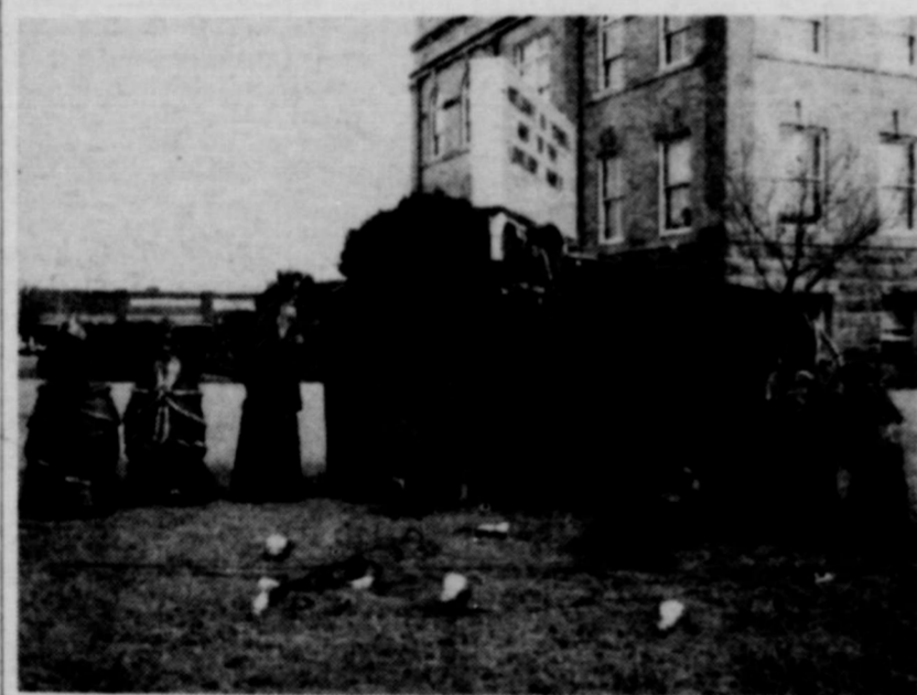
NATIVITY SCENE—The nativity scene purchased with donations solicited by the Women's Service League last year, was put up on the northwest corner of the square last week.