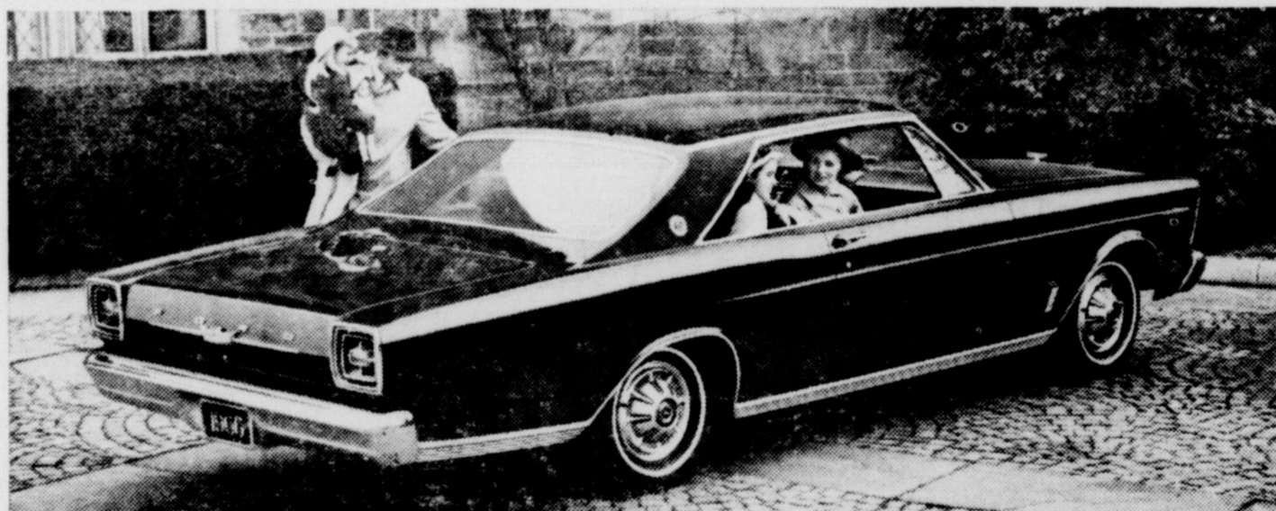
Ford's quiet ride whispers it...

The Texas Forestry Association urges you to take time to help. Help Keep Texas observing Fire Prevention every week.