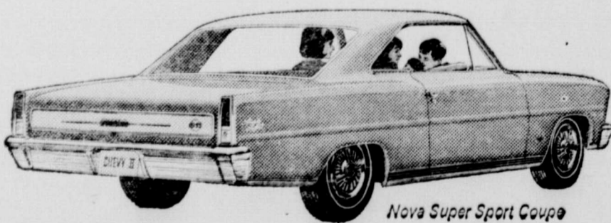
Nova Super Sport Coupe