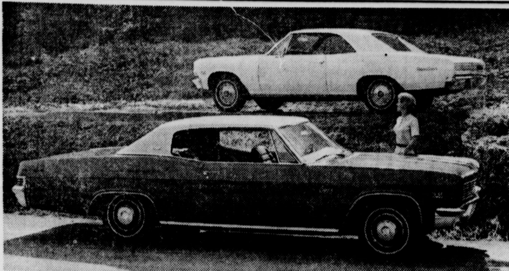
Two of Chevrolet's newest additions for 1966 are the luxurious Caprice Custom Coupe (below) and the stylish Chevelle Super Sport 396 Coupe. The Caprice Coupe is destined to be the style leader among regular size cars and the Chevelle Super Sport is distinguished by a new roof line with recessed rear window and a '396 SS' identification in grille and rear cover area. Caprice models feature distinctive wraparound rear lamps. Along with these two models, Chevrolet will offer 48 other models for 1966. Dealers will show the new cars for the first time Oct. 7.