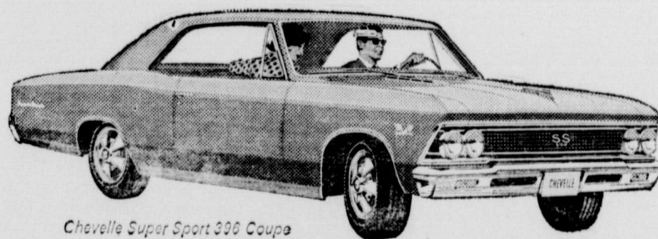
Chevelle Super Sport 396 Coupe

New 300's. New 300 Deluxe models. New Malibus. And two new Super Sport 396's—coupe and convertible—with engines that tell you exactly what kind of Chevilles they are. Both are available with 396-cu.-in. Turbo-Jet V8's, either 325 hp or 360 hp. And both come with special hood, grille, suspension, emblems, red stripe tires, floor-mounted shift. Twelve beautiful new Chevilles in all—and all as new inside as they are outside, headlamps to taillights.