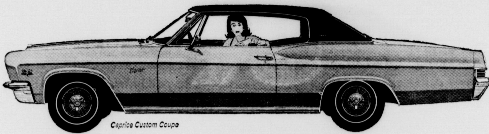
Caprice Custom Coupe