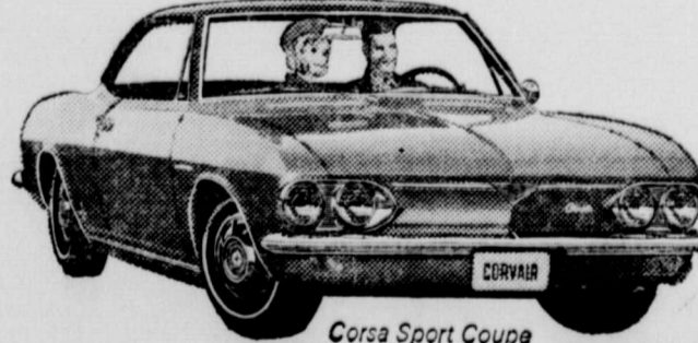
Corvair Sport Coupe