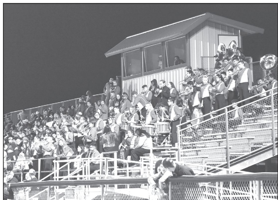
FHS Chieftain Band