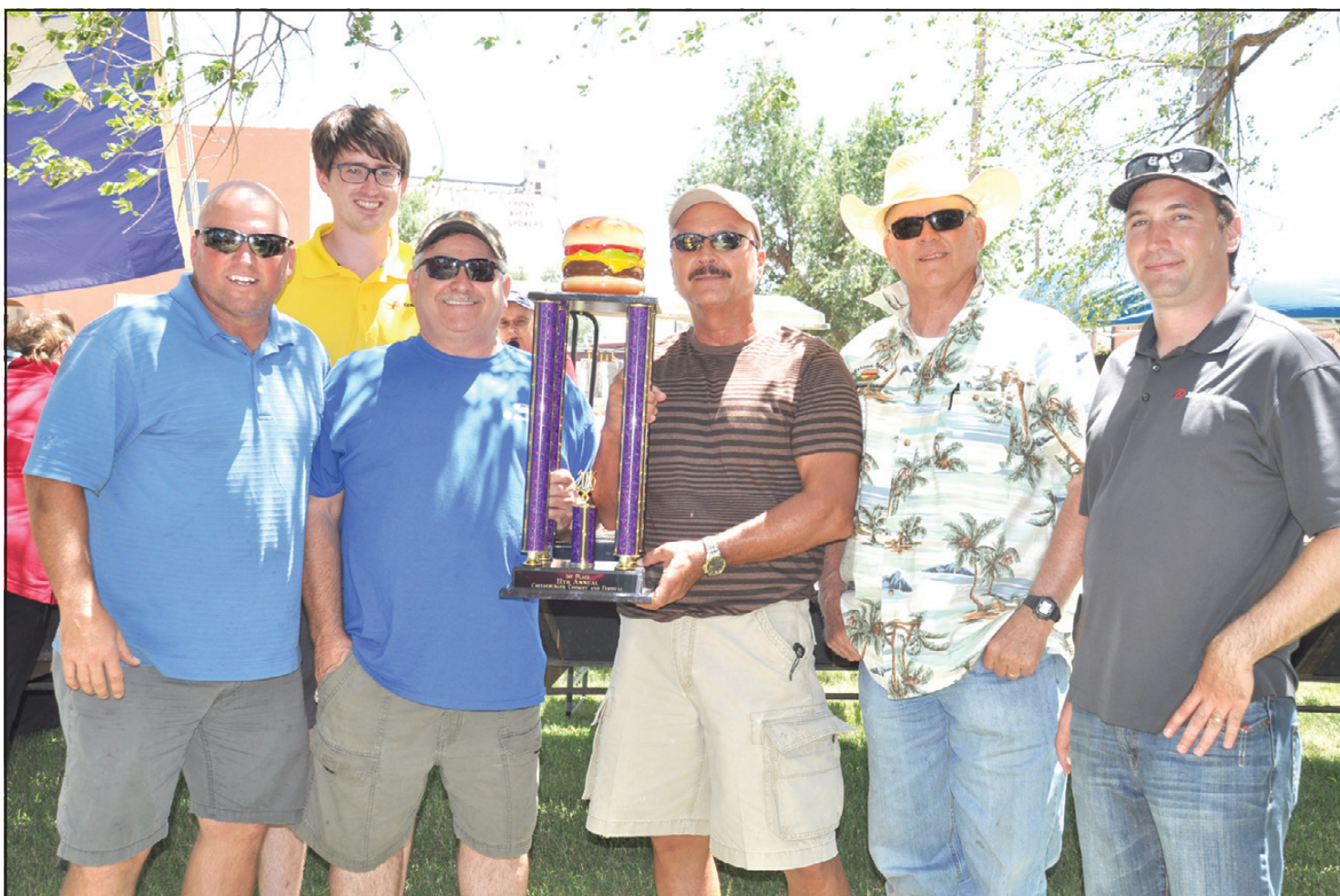
Can the 2016 Champion Cheeseburger team of Xcel Energy come back in 2017 to take the title again? Come on out the the Friona City Park this Saturday and check out the competition. There are ten teams competing this year. Cheeseburgers go on sale at 11:30 a.m. Wristbands are $7 and available at the Chamber Office or at the park the day of the 12th Annual Cheeseburger Festival and Cook-off.

For more information, call (575) 749-2880.