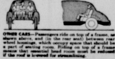
OTHER CARS—Passenger sits on top of a frame, as shown above, and in the rear seat, between rear wheel housings, which occupy space that should be part of seating room. Riding on top of a frame means that essential head room must be reduced if the roof is lowered for streamlining.

And how about seating room? Hudson's new design reclaims space formerly taken up by wheel housings and protruding fenders. This is accomplished by placing rear seats ahead of the rear wheels, in a zone unrestricted by wheel housings. As a result, rear seats are 13 inches wider in this car that is only little more than four inches wider over-all. Both rear and front seats extend the full width of the body, giving Hudson the roomiest seats in any American-made car! Hudson's use of the "step-down" zone and unique seating arrangements are illustrated in the sketches that follow: