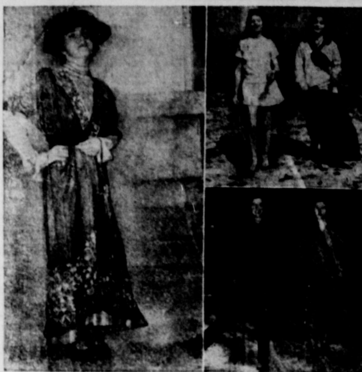
FASHIONS OF BY-GONE DAYS ... Homecoming at Flora McDonald (right), Red Springs, N. C., featured the costumes of other days, as well as the latest in modern styles. A riding skirt, built for side-saddle riding, was among the creations. The tennis scores must have been terrible with the 15-pound skirts.