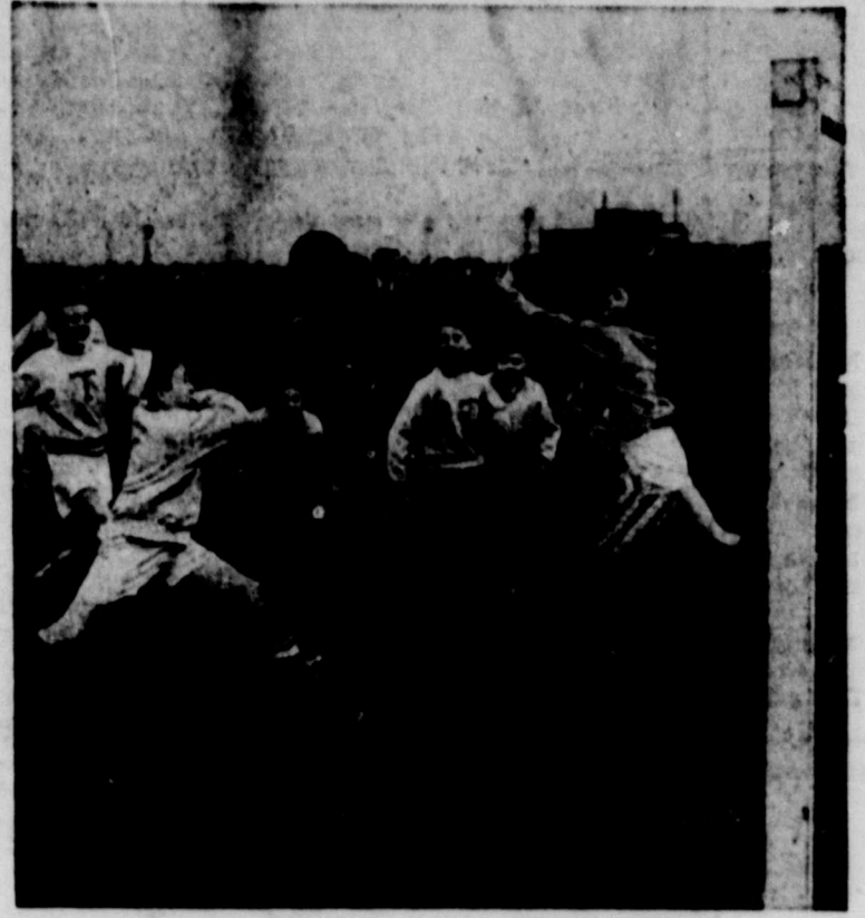
Soccer was the first kind of football played in the United States. It is the only game of football played in most of the world. The greatest single soccer organization in the world is the Lighthouse Boys' club in Philadelphia, consisting of some 500 players. Photograph shows how the club is developing new champions from among the youngsters.