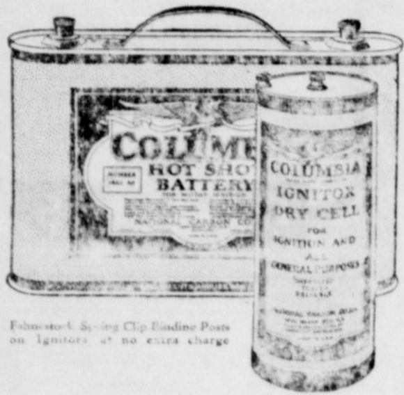
Edison-style Spring Clip Binding Posts on Ignitors at no extra charge