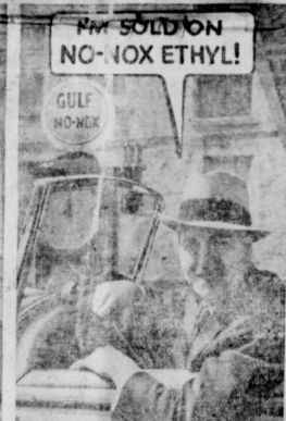
He'll pay more and get more!

3 kinds of gasoline for 3 kinds of buyers!