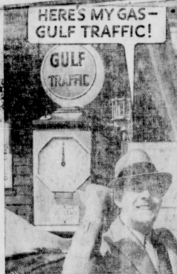
He knows his low-priced gasoline!

Come in and ask about our chicken and hog feed. We have the good feed priced right.