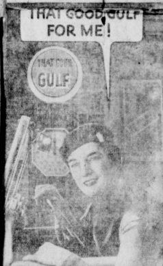
She's a shrewd shopper!