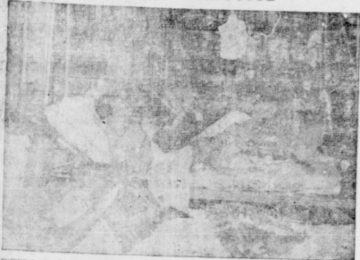
WHERE HARD GUYS of the battlefield, men who met the enemy at beyond seeing so that when ready they can accept training provided by Victory Loan and some again stand on their own economic feet, heads proudly erect and say, "This Is America."