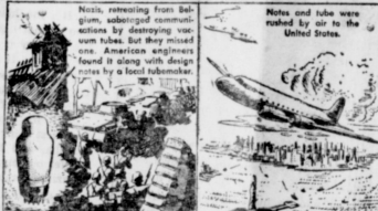
Notes, retreating from Belgium, sabotaged communications by destroying vacuum tubes. But they missed one. American engineers found it along with designs for a local transmitter.