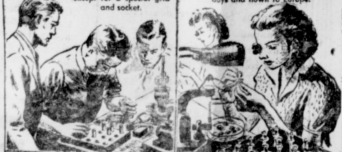
Notes and tube were rushed by air to the United States.