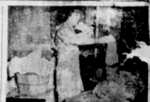
can also be sorted on a table or counter or from the table to several baskets placed on chairs.