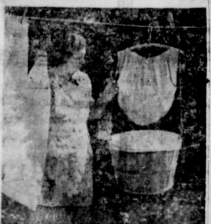
A clothespin apron snaps over the hanger. The hanger hook slides along the clothesline as she pushes the contrivance ahead of her.

Sorting clothes on the floor requires constant stooping. Mrs. Frey separates clothing into several baskets set on wooden crates. Laundry