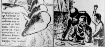
As Bell Laboratories tests and Xerox reproduced their a similar tube could be built from existing parts of American tubes except for a special grid and socket.