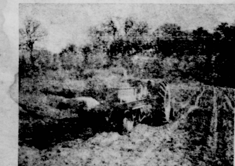
JERRY MEHAFFEY of Gorman owns a 160 acre farm located three miles south of Carbon. The above picture shows a Coastal Bermuda sprigging machine in operation. Jerry planted 163 acres of Coastal in 1964, built cross fences to divide this area into three pastures and constructed farm ponds for livestock water. A cow and a calf is run for a six-month period on approximately two and one half acres. Fertilizer in keeping with soil test is applied annually.

... the executive committee will meet March 18, to draw for places on the May 4 Democratic Primary ballot.