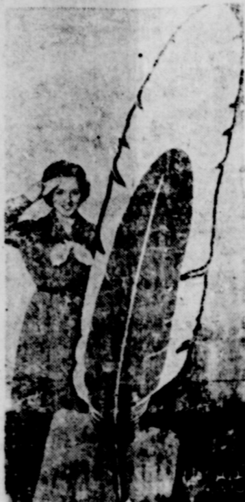
Girl Scouts all across the country salute the bigger Red Feather—symbol of the large scope of Community Chest activities made larger by the cooperation of all good citizens.