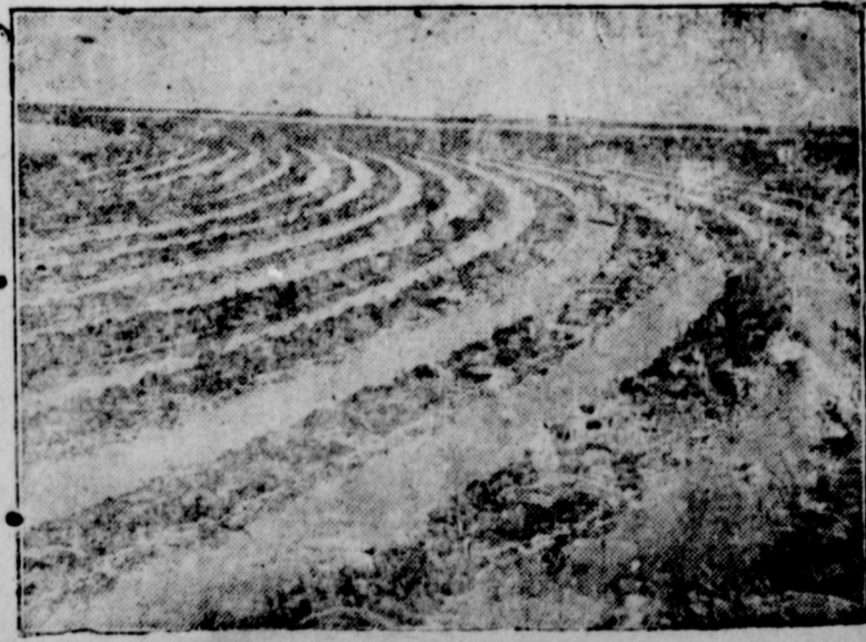
Farming on the contour and stubble mulching helps to hold water where it falls

We Invite You See Us For A Good Used Car We do want to see you, You need a Car We Need Your Business Muirhead Motor Company Buick & Pontiac Dealer Eastland