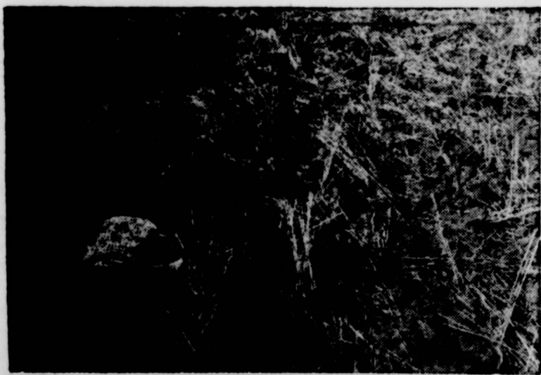
Farming on the contour and stubble mulching helps to hold water where it falls