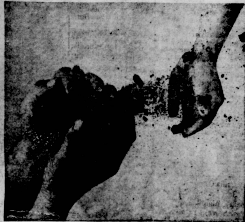
CRUMBLY OR CLODDY — Crumbly soil is in good tith and a pleasure to work. Cloddy soil is hard to work and restricts plant growth. Good management makes soil crumbly easy to work and allows maximum plant growth.

Tillers of the soil enjoy working crumbly friable soil in good tith. It is disheartening to have to work soil that is cloddy and run together. Good tith is of major importance to the backyard gardener as well as to the large scale farmer.