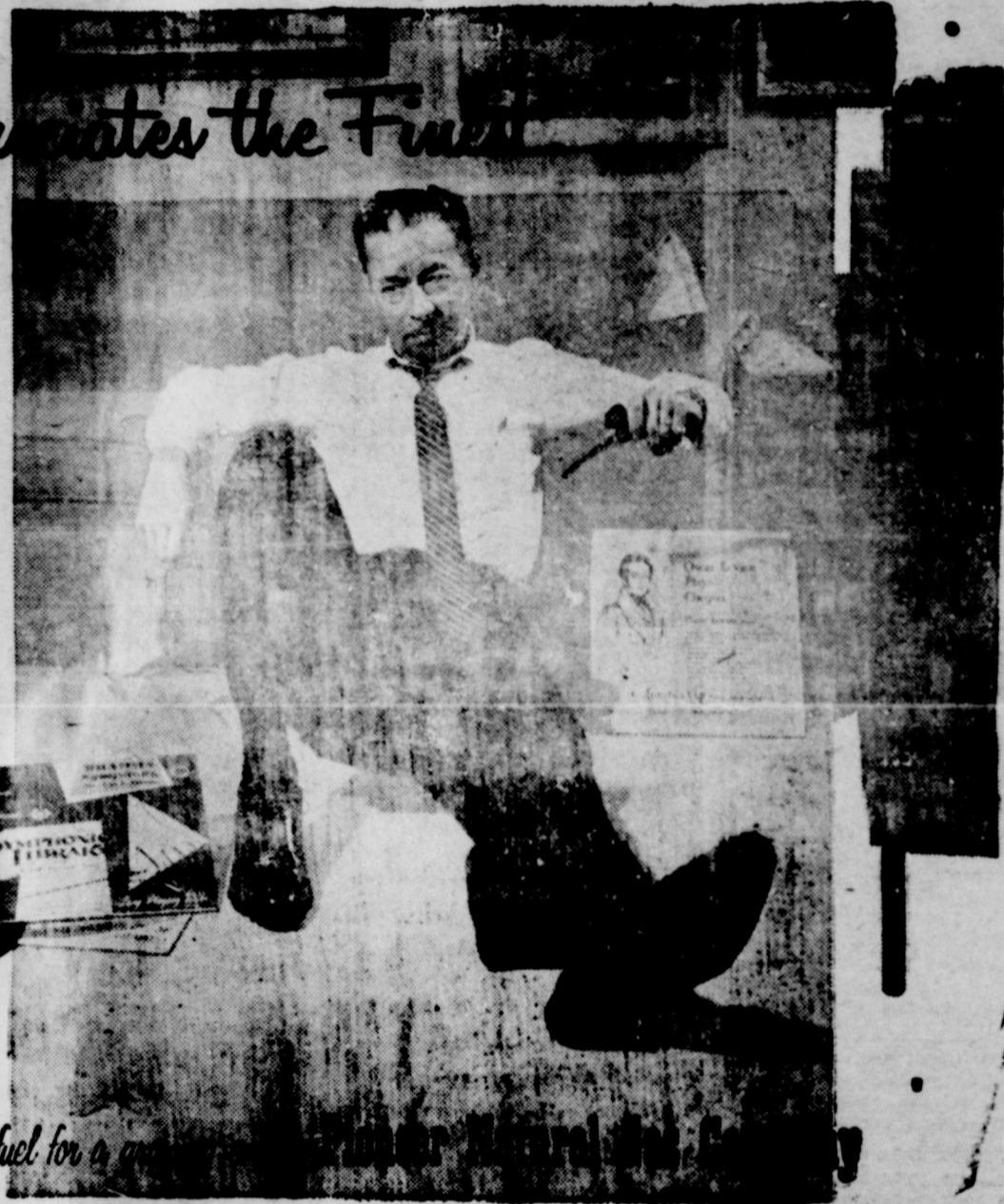
fuel for a...