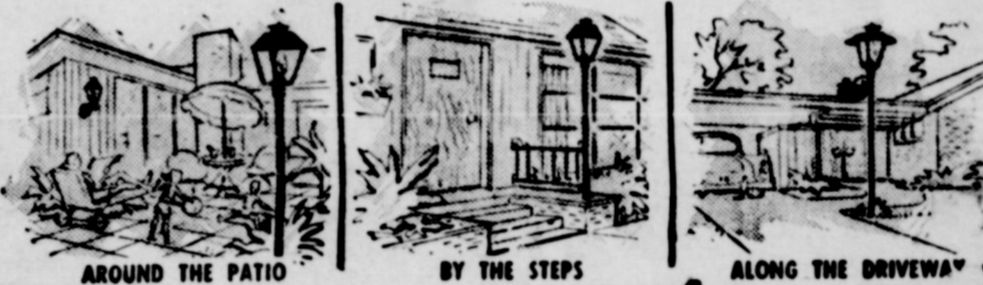
AROUND THE PATIO