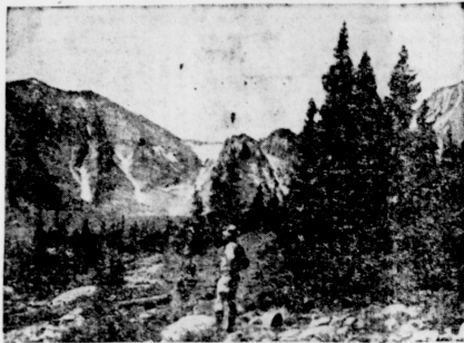
SCENIC WONDERLAND . . . Typical of the rugged and awe-inspiring beauty of the four national parks in the Rockies is this scene in Rocky Mountain National park in Colorado.

BUY YOUR EXTRA SAVINGS BONDS NOW SECURITY PROTECT YOUR FUTURE