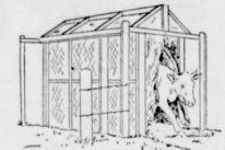
Type of cattle horn-fly trap recommended by Macdonald college.

The glass in the roof is coated on the inside with DDT and protected from the cattle by coarse screen