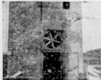
Silo converted for mechanical curing of hay and other forage crops.

In this latest many never farm electrification developments, air enters the hay through vents in the