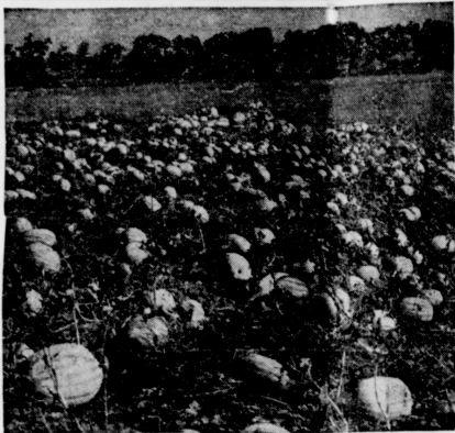
EUREKA: IT'S PUMPKIN TIME... Fields of golden pumpkins are ripening near Eureka, Ill., pumpkin center of the world, which will stage its fifth annual Pumpkin Festival September 26 and 27.