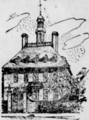
Governor's Palace, Williamsburg

The fine flavor of Maxwell House Tea makes it the tea lover's choice. Selected from choice Ceylon and India teas—specially blended to suit the Southern taste!