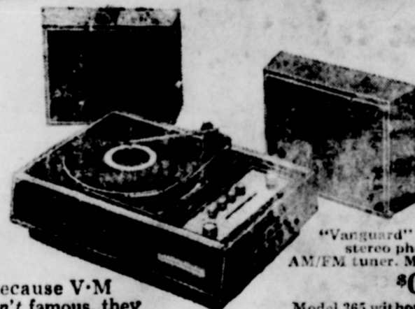
"Vanguard" portable stereo phone with AM/FM tuner. Model 372. $00000 Model 365 without tuner.

Because V-M isn't famous, they have to look better, sound better, and cost less. Like the "Vanguard." Versatile modular design. New "Cue" tone arm lets you stop a record anywhere then start again where you left off. Tone arm has the new counter-balance design, too. Solid State circuitry throughout. And both kinds of radio listening—AM and FM. Optional dust cover too. See it. Hear it. Then get yours, quick. Before they get famous.